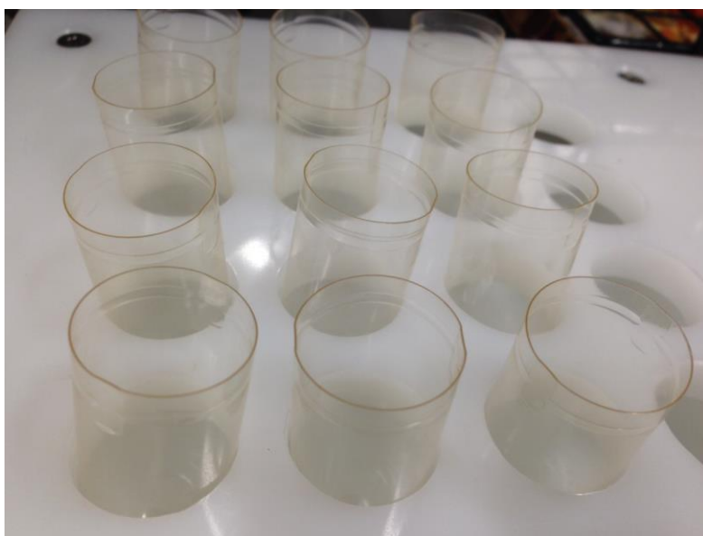
Figure 1. Open empty capsules. Place 12 'bottoms' (larger half of each capsule) into holes of homemade capsule tray or test tube rack. Set 'tops' aside for now. The number of capsules needed will be determined by the ethambutol dose.

*TORPAC size 10 (18ml) capsules, http://www.torpac.com/reference/sizechart/