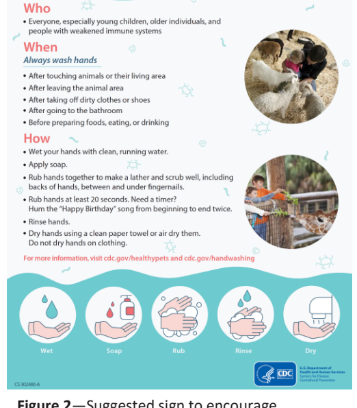
Figure 2 —Suggested sign to encourage compliance with handwashing procedures as a means of reducing the possible spread of infectious disease. <sup>[252]</sup>